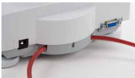
Built-in security bracket