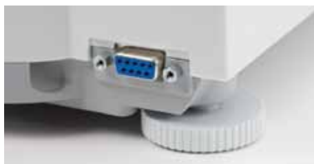
RS232 interface for data connectivity